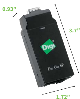
DigiOne® SP - FRONT